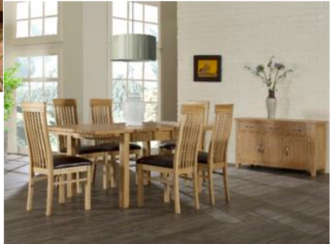
Dining Room Furniture Modern and Colonial Style