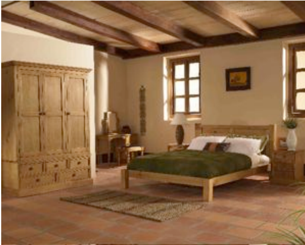
Bedroom Furniture Modern and Colonial Style